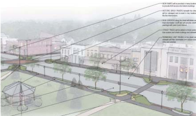
Corner planting perspective