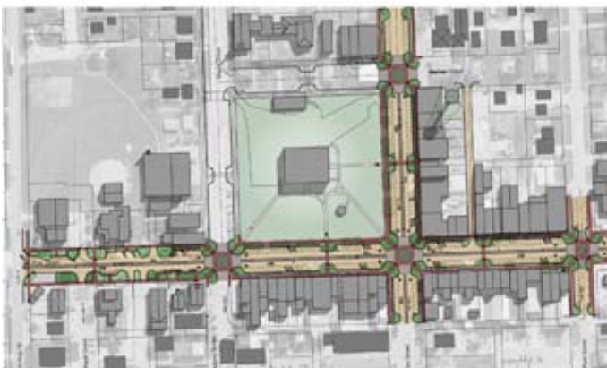
Streetscape improvements plan view

The Iowa Green Streets Pilot Project is a community-wide sustainability initiative to serve as a catalyst for further investment in the historic downtown of West Union, Iowa. The project began with a visioning workshop in October 2007 when Iowa's Department of Economic Development (IDED) completed a Technical Assistance Visit to advise West Union about the potential for multi-purpose pedestrian-scale streetscape improvements. The result of the initial visioning and the subsequent Conceptual and Schematic Planning was a Streetscape Master Plan, which has led the Pilot Project, now in the construction documentation stages.