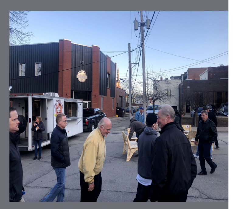
Community Members enjoy barbecue sandwiches and sit in Wikiblock cafe sets.