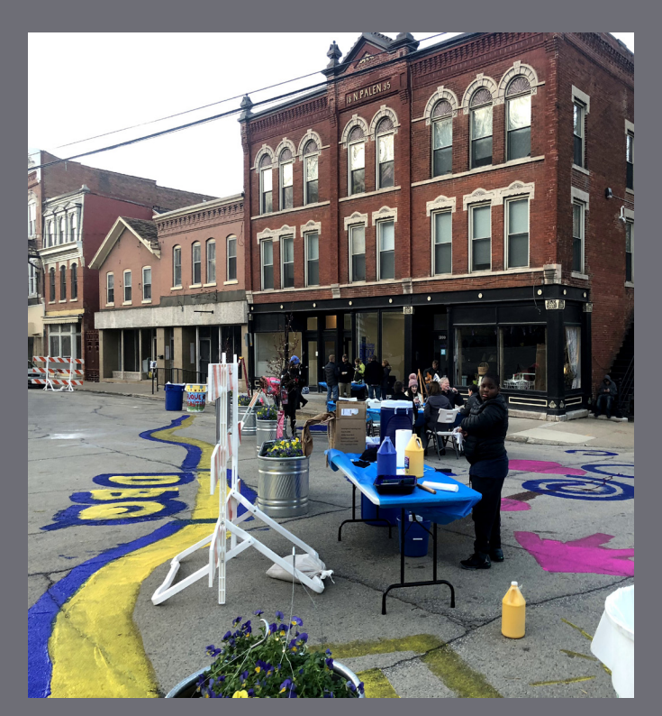
Community members enjoying the pop-up plaza in the street.

For the mini-build project, we created a pop-up plaza for pedestrians. The plaza was buffered using plants, hay bales, and metal troughs. Local kids painted the street with tempera paint to provide a differentiation between the pedestrian area and the open street as well as to inject art and creativity into the space. A musician and food and drinks were brought out for people to enjoy while they were in the newly created plaza.