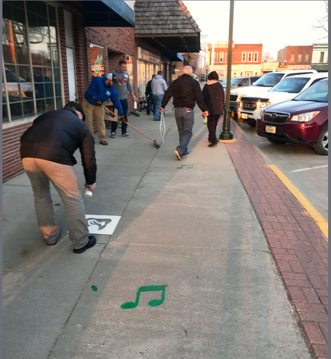
Community members injecting art into their community.

For the mini-build project, we interjected art and spontaneity into downtown while highlighting the proximity of parking to the businesses on the square. We took five stencils that were based on businesses in and on the square and used kid's finger paint to paint paths from the parking lot to the businesses.