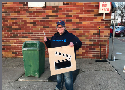
Community member posing with a stencil directing people to the movie theater.