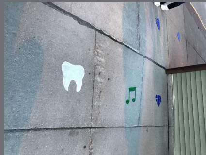
Stencils led to dentist offices, the Warren Cultural Center, the movie theater, jewelry shops, and hair salons.