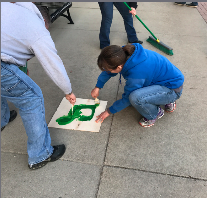
Community members paint notes leading to the Warren Cultural Center.