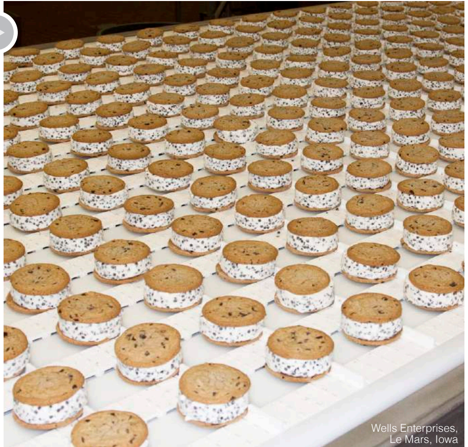
Wells Enterprises, Le Mars, Iowa